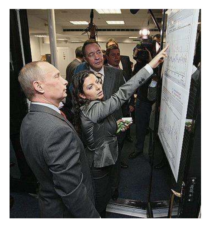
Simonyan shows RT facilities to then Prime Minister Putin. Simonyan was on Putin's 2012 presidential election campaign staff in Moscow (Rospress, 22 September 2010, Ria Novosti, 25 October 2012).

The Kremlin staffs RT and closely supervises RT's coverage, recruiting people who can