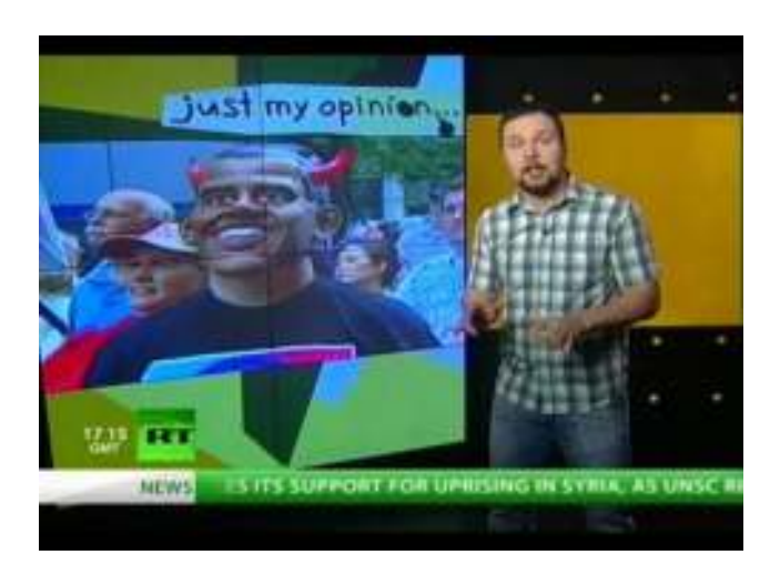
Messaging on RT prior to the US presidential election (RT, 3 November)

party candidate debates and ran reporting supportive of the political agenda of these candidates. The RT hosts asserted that the US two-party system does not represent the views of at least one-third of the population and is a "sham."