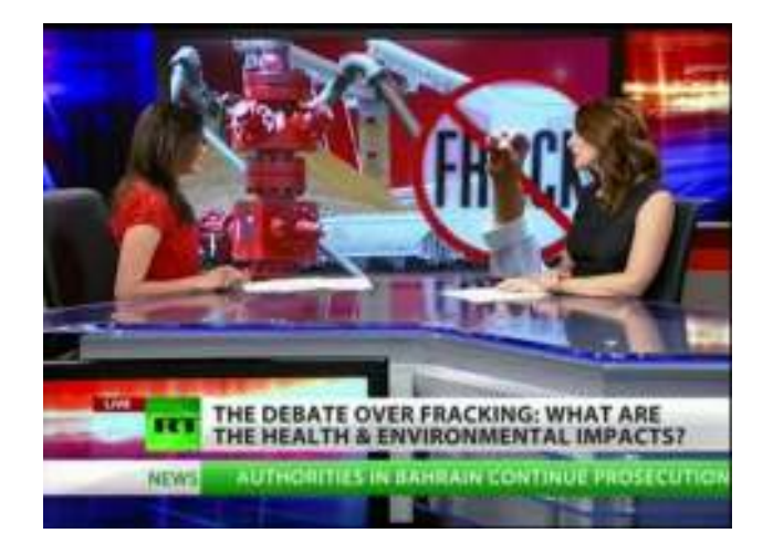
RT anti-fracking reporting (RT, 5 October)

In an earlier example of RT's messaging in support of the Russian Government, during the Georgia-Russia military conflict the channel accused Georgians of killing civilians and organizing a genocide of the Ossetian people. According to Simonyan, when "the Ministry of Defense was at war with Georgia," RT was "waging an information war against the entire Western world" ( Kommersant , 11 July).