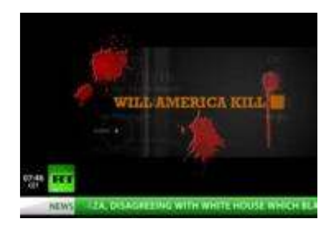
RT new show "Truthseeker" (RT, 11 November)

RT aired a documentary about the Occupy Wall Street movement on 1, 2, and 4 November. RT framed the movement as a fight against "the ruling class" and described the current US political system as corrupt and dominated by corporations. RT advertising for the documentary featured Occupy movement calls to "take back" the government. The documentary claimed that the US system cannot be changed democratically, but only through "revolution." After the 6 November US presidential election, RT aired a documentary called "Cultures of Protest," about active and often violent political resistance (RT, 1-10 November).